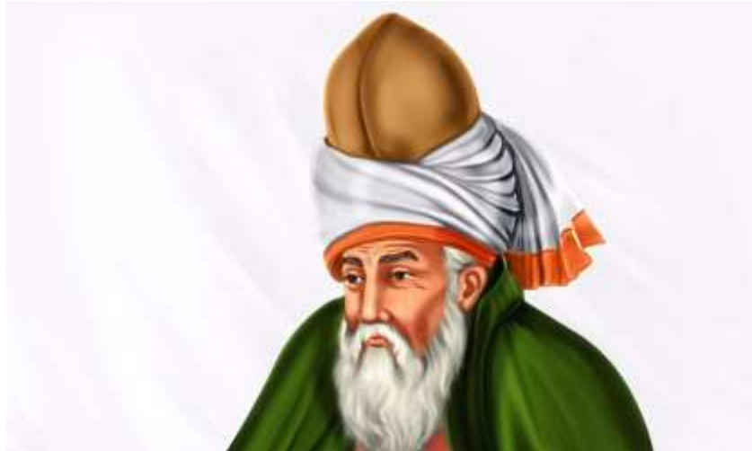
Figure 2: Jalaluddin Rumi