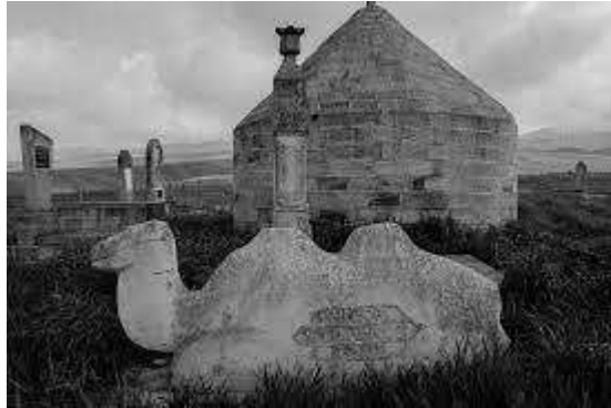
Figure 1: Sufism as product of collective imagination

devoid of hopes for paradise or fears of hell. This concept formed the basis of Sufism's traditional mysticism (Rastgoo Far & Bozorgi, 2013).