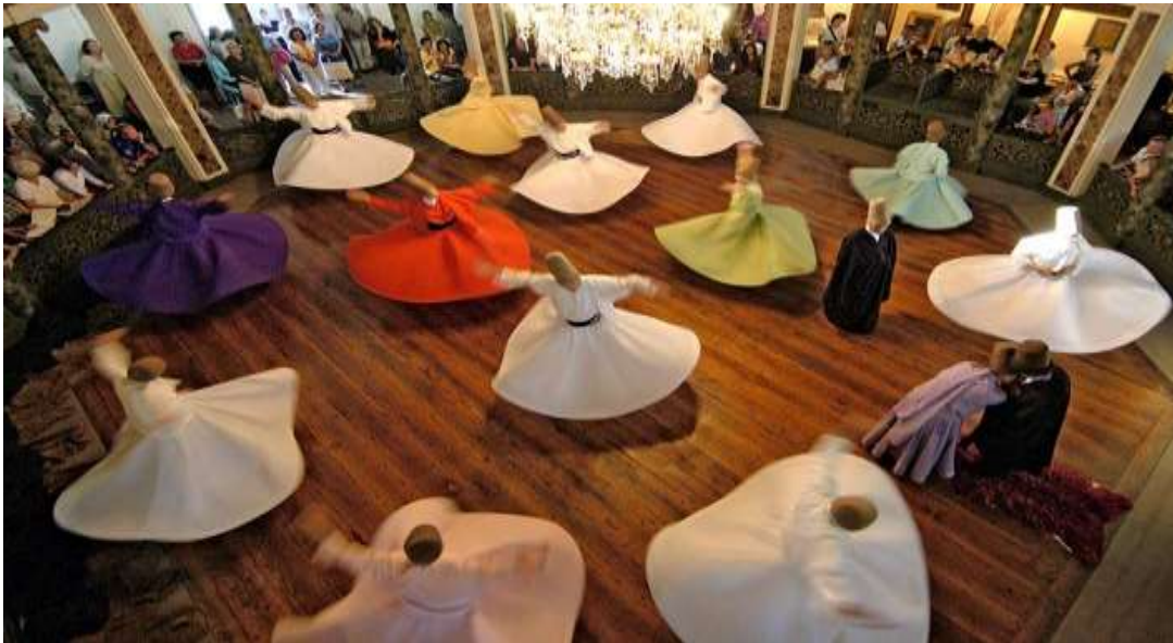
Figure 3: Sama, Ecstasy in Sufism

Sama, or listening to music to alter one's state of consciousness, is a distinctive Sufi practice. It involves experiencing divine ecstasy through music and often leads to public displays of intense emotions. However, Sama has been a source of controversy within the Sufi tradition (Guilhon, 2017).