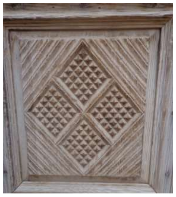
Plate.6. closer view of the motif of the door presented in plate 5.

In plate5 and 6, the geometric pattern involves shapes and lines in a symmetric manner and creates a link with the harmony and balance present in Islamic art motifs and geometric designs. Geometric motifs are one of the strongest elements of Islamic art. Both geometric and floral designs are used in Islamic art collectively, to create a better aesthetic quality involving unity, rhythm, symmetry as well as eternity all together.