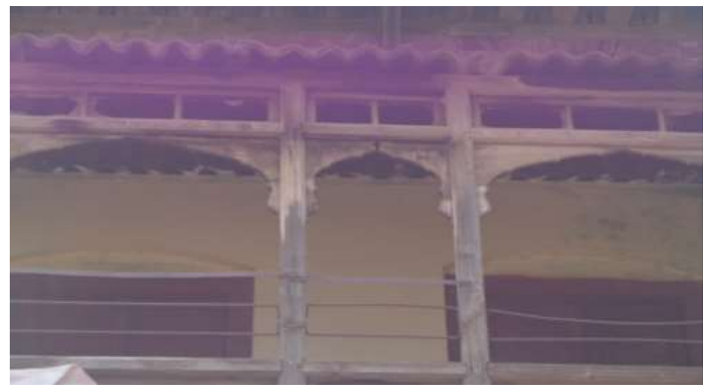
Plate.3. Wooden Balcony of a house.

Some examples of wood work, emphasizing the wood carving of Bhera are presented here.