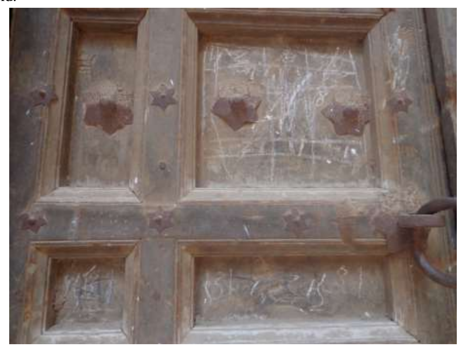
Plate.10. Star shaped iron nail.

petal carved flowers. There is an iron star shaped nail to fix the rectangular block with the panel of the door. Star motif is a noticeable influence of Islamic art, which is found in many geometric patterns of Islamic art present all over the world.