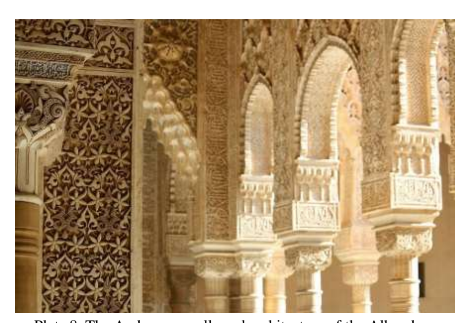
Plate.8. The Arabesque walls and architecture of the Alhambra;