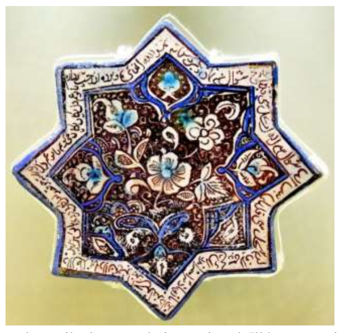
Plate.11. 8-pointed star tile, luster technique, glazed. Ilkhanate period, 2nd half of the 13th century CE. From Kashan, Iran