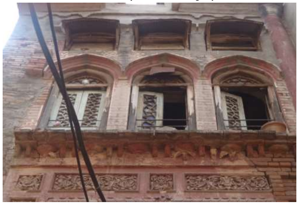
Plate.4. Wooden windows of a house.