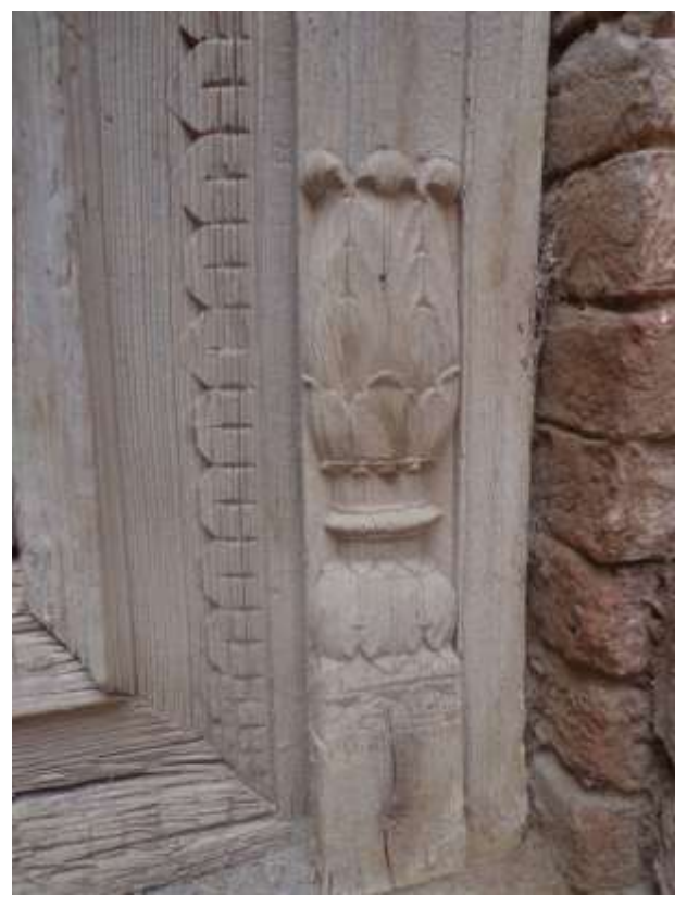
Plate.9. Carved patterns on both sides of wooden frame of door.

The carved doors of houses have many panels and parts, including the different panels of door, all carved skillfully with both floral and geometric motifs present on them. There is an observable influence of Islamic design patterns and Islamic art motifs present on the wood carvings of bhera. There is a block raised with a carved motif, placed on the central panel between the double doors. Carved motifs of different designs are also present on the bottom corners of the wooden frame of doors. In the door present in Plate 5, there are geometrical patterns used by the craftsman to create this art piece of unique quality. The double panel door is divided in further 8 panels by design, and each square is decorated by different geometrical lines and patterns, by using the technique of wood carving. At the inner edge of the upper panel of the door, there is a raised panel which is again occupied by a rectangular raised structure in the Centre, which is decorated by carving an eight-petal flower in the centre, along with geometrical patterns and motifs on upper and lower sides of the rectangular block. This central panel is known as "beeni" by locals of Bhera and it is mostly decorated with six or eight