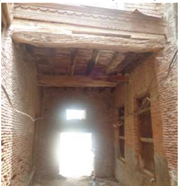
Plate.2. Covered street in Mohalla Firashan wala.

the middle of the door. (Hussain, 2011) Some of the streets are covered with wooden structures with carving present on them. These are decorative remains of the glorious history of the craft of wood carving in this region.