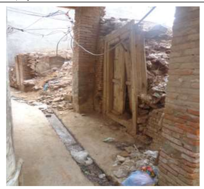
Plate.1. Recent situation of a street in Old city of Bhera.

Bhera is also known as the graveyard of buildings, due to the ruins of wood worked houses present all over the city, and scattered in different Mohallas and Streets. The wood work in domestic architecture is among the significant specialties of Bhera. Situated on the bank of river Jhelum, Bhera was a principal source of timber in the region. This led the town to produce some finest examples of urban architecture using brick and timber wood in jharokas, balconies and elaborated doorways. One of many attractive features, was a wooden carved walkway built to link two houses belonging to same family across the road.