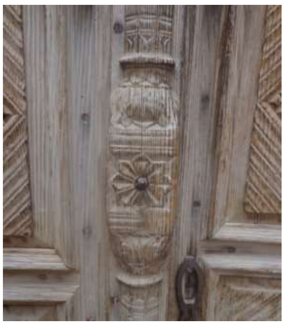
Plate.7. Central raised part between two doors, known as beeni by locals.